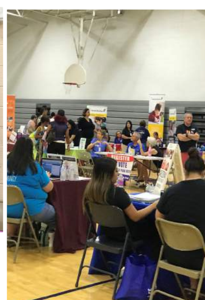
Avondale Middle School Auditorium where fair took place.

Lion Members from Goodyear, Buckeye and Peoria Pioneer Lions Club collaborated to provide eye screening for 300 students ages ranging five and up